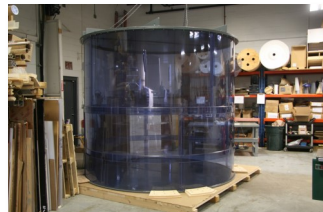
NASA PVC Tank